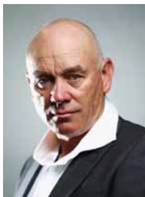
Dr Ric Charlesworth AM

Ric is a renowned coach and mentor, author, doctor of medicine, former Member of Parliament and former captain and coach of many gold medal winning