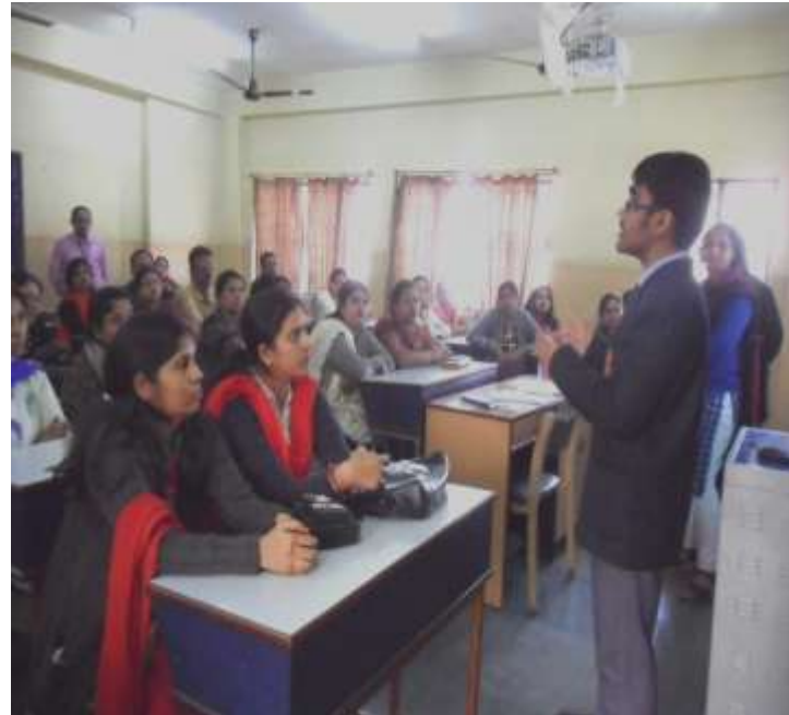
WORKSHOP FOR PARENTS BY OUR STUDENTS