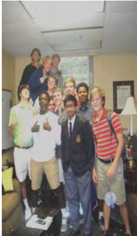
STUDENT EXCHANGE PROGRAMME