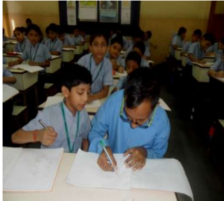
LENDING A HELPING HAND TO OUR MENTALLY CHALLENGED BOYS.