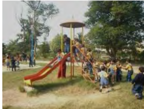
FUN AND GAMES