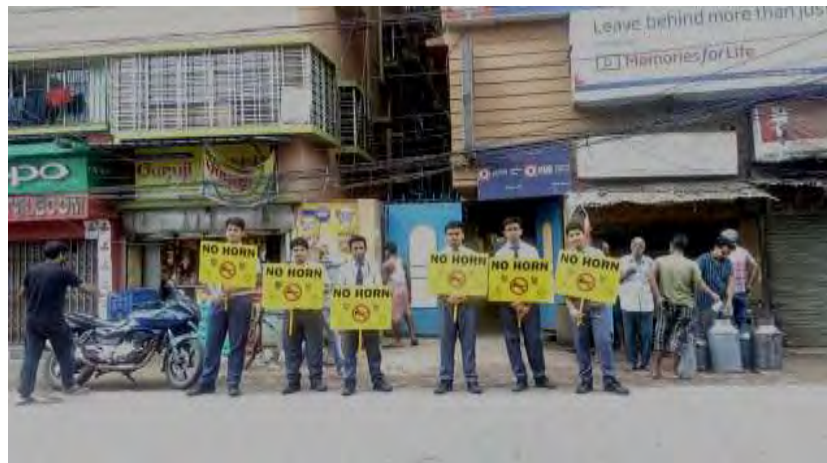
ANTI- HORN CAMPAIGN