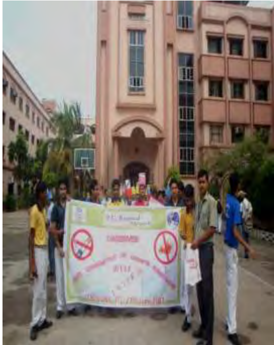
‘ANTI DRUG’ RALLY