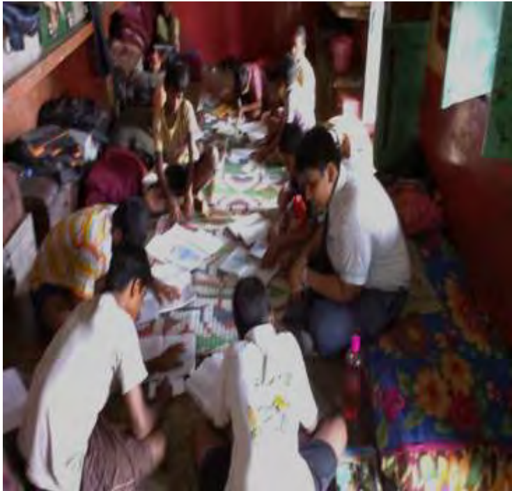
TEACHING BOYS AT AN ORPHANAGE.

WE MAKE A LIVING BY WHAT WE GET, BUT WE MAKE A LIFE BY WHAT WE GIVE.