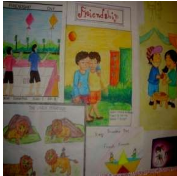
DRAWINGS FOR FRIENDS