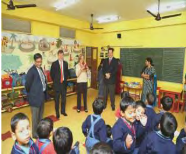
VISIT FROM ST. CHRISTOPHER'S SCHOOL, VIRGINIA.