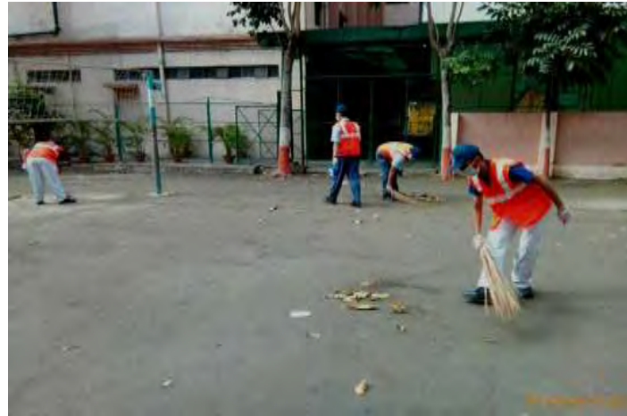
PROJECT ON ‘A CLEANER INDIA’.