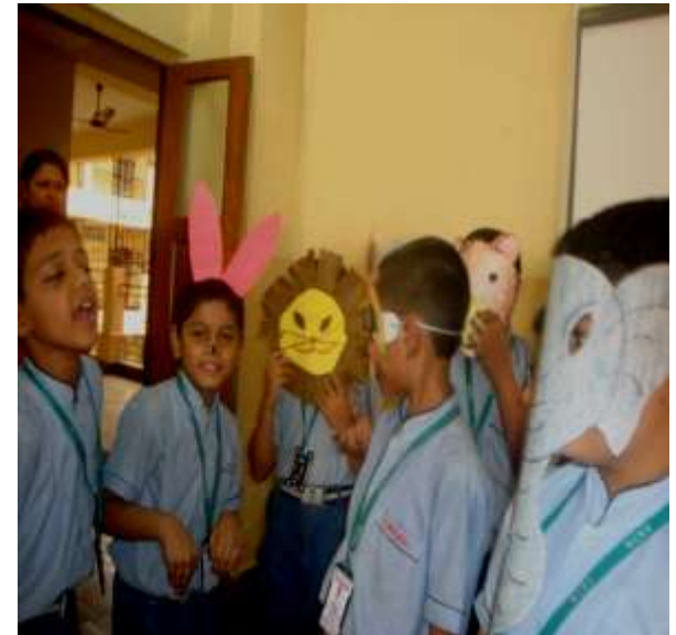
SELF- DIRECTED DRAMAS