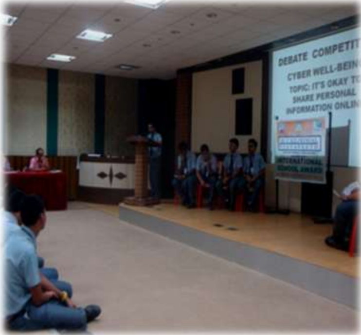
DEBATE ON CYBER WELL- BEING