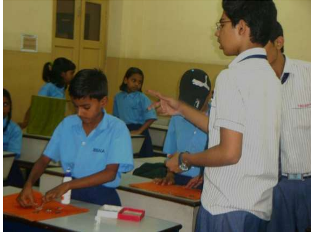
TRAINING THE CHILDREN OF THE LOCALITY