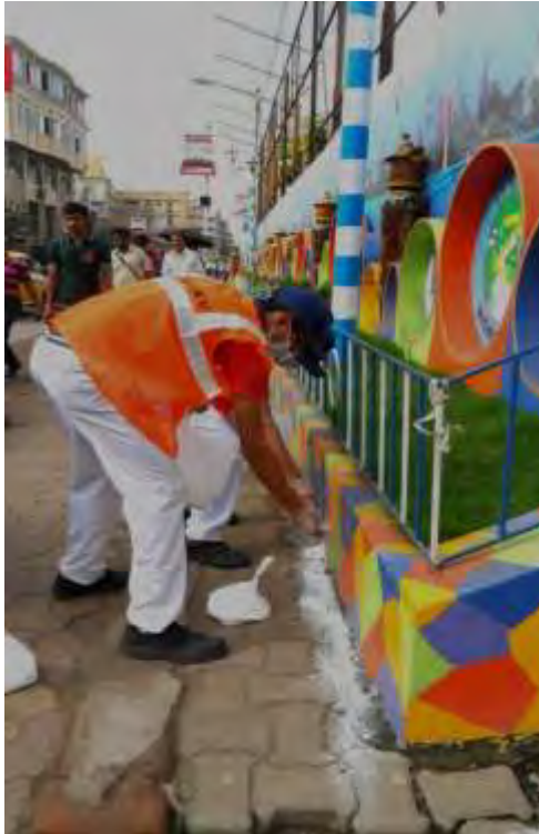
PROJECT ON 'CLEANLINESS'

ONLY A LIFE LIVED FOR OTHERS IS A LIFE WORTHWHILE