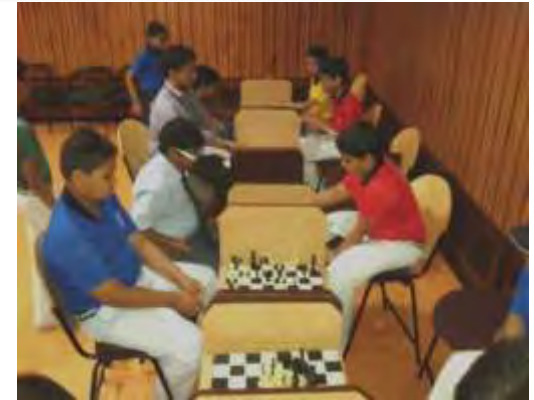
CHESS---IT'S ALL IN THE MIND