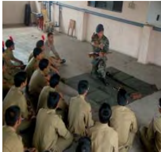
TRAINING OF OUR NCC CADETS