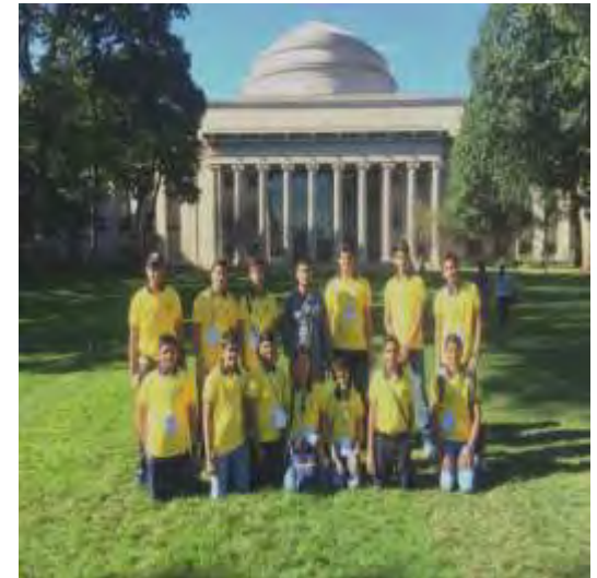
VISIT TO 'MIT'— ENCOURAGING OUR BOYS TO STRIVE TO LIVE THEIR DREAM