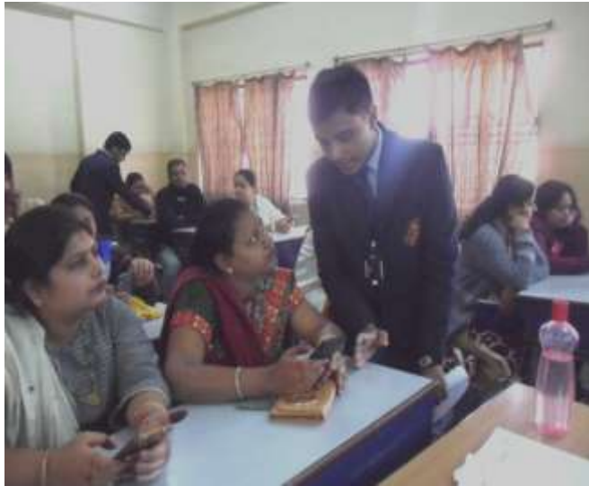
ORIENTATION OF PARENTS